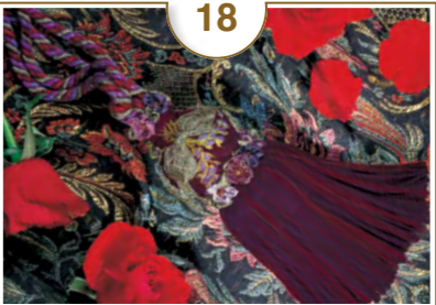
ALL ROSES Kris Richards of Australia Superb handbag with trailing roses PAGE 16